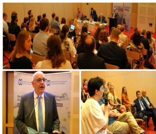
Speakers and participants at the RRP mid-year stock taking event in Bucharest on 14 July 2023.

On 14 July, the Inter-Agency Coordination platform held a Refugee Coordination Forum meeting to take mid-year stock on the implementation progress and the funding situation of the Regional Refugee Response Plan (RRP) 2023 in Romania. Nearly 60 participants of NGOs, humanitarian organizations, UN agencies and embassies attended the briefing in Bucharest. Dr. Raed Arafat, Secretary of State, Head of Department of Emergency Situations delivered opening remarks during the briefing. In 2023, 34 humanitarian actors (14 national NGOs, 14 international NGOs and 6 Agencies) appealed for US$ 153.6M for activities for the refugees from Ukraine hosted in Romania. Over the past weeks, the Inter-Agency team conducted a Programme Criticality exercise to assess urgent sectorial needs to support refugees from Ukraine in Romania. Main financial gaps are affecting activities concerning protection (such as prevention of and response to gender-based violence, counter-trafficking etc), education and health. So far in 2023, the RRP in Romania is 37 per cent funded.