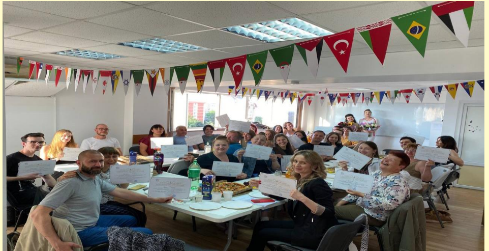
Romanian language course graduation, Brasov

Recognizing the importance of a holistic approach to integration, MIC has been organizing Romanian language courses and socio-cultural activities for adult refugees. Drawing on its experience dating back to 2011, these courses and socio-cultural activities have played a crucial role in empowering newcomers to Brasov and helping them feel at home in their new surroundings.