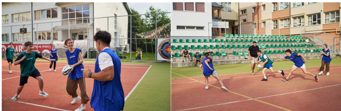
Sports4Development demonstration in Suceava Sport High-School with Ukrainian and Romanian Adolescents led by UNICEF