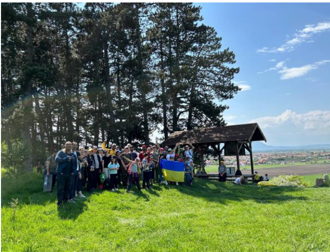
Building social cohesion, multicultural picnic, Brasov

MIC also collaborates closely with local authorities, conducting advocacy sessions about refugees and migrants' integration within the city. Through reliable partnerships and successful referral mechanisms, MIC has fostered meaningful connections with local NGOs, strengthening the overall response to the refugee crisis. Since the beginning of this endeavour on the 1st of March 2022, MIC has successfully provided support to more than 4,500 individual refugees from Ukraine living in Brasov city and its environs.